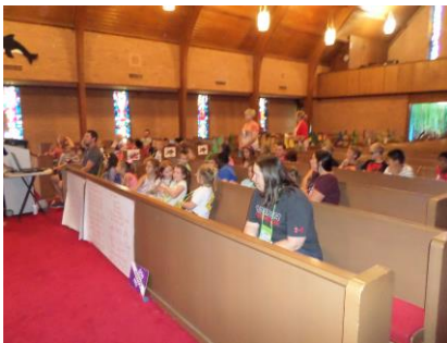
VBS JULY, 2016